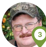
TJ Kartes Farm Blooming Prairie, MN