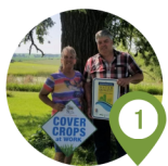
Twin Oaks Farm Northfield, MN

Join farmers, industry representatives, and elected officials on a free bus tour of three farms in the Cannon River Watershed. Experienced farmers will teach you about profitable conservation practices in our region, including strip-till, no-till, cover crops, and winter camelina. You will also gain valuable information about Carbon Intensity Score, carbon credit programs, and market opportunities. The tour includes morning snacks and lunch.